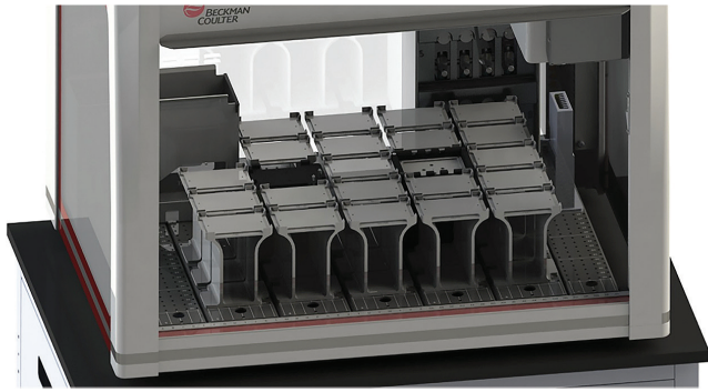
Figure 1. Have one to several plates to process on a regular basis? The i5 Span 8 or the i5 Multichannel system removes the burden of tedious manual tasks of cell-based assays. The Biomek platform aids in providing reliability for the critical step in your workflow.