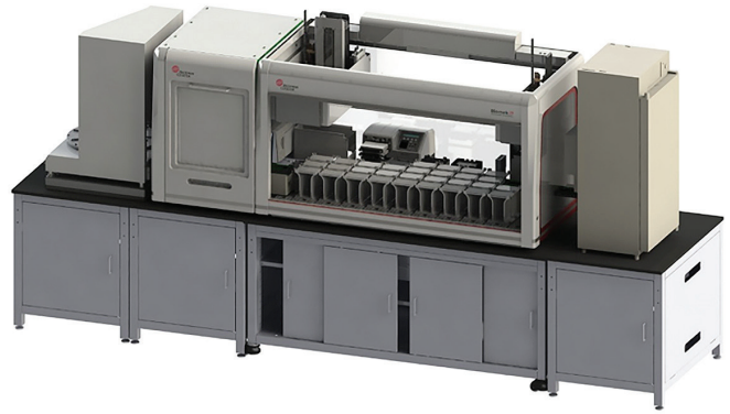
Figure 2. Standardize your workflow with a complete walk-away solution. Modular design creates an adaptable system to automate your broad range of cell based assay workflows while increasing the laboratories' productivity.

Transform your Biomek liquid handler into a complete workflow solution that will optimize the efficiency, consistency, and reliability of your lab operations. From simple on-deck devices to complete robotic systems, we can develop focused, yet flexible, Biomek-based solutions by integrating Beckman Coulter and third-party instruments.