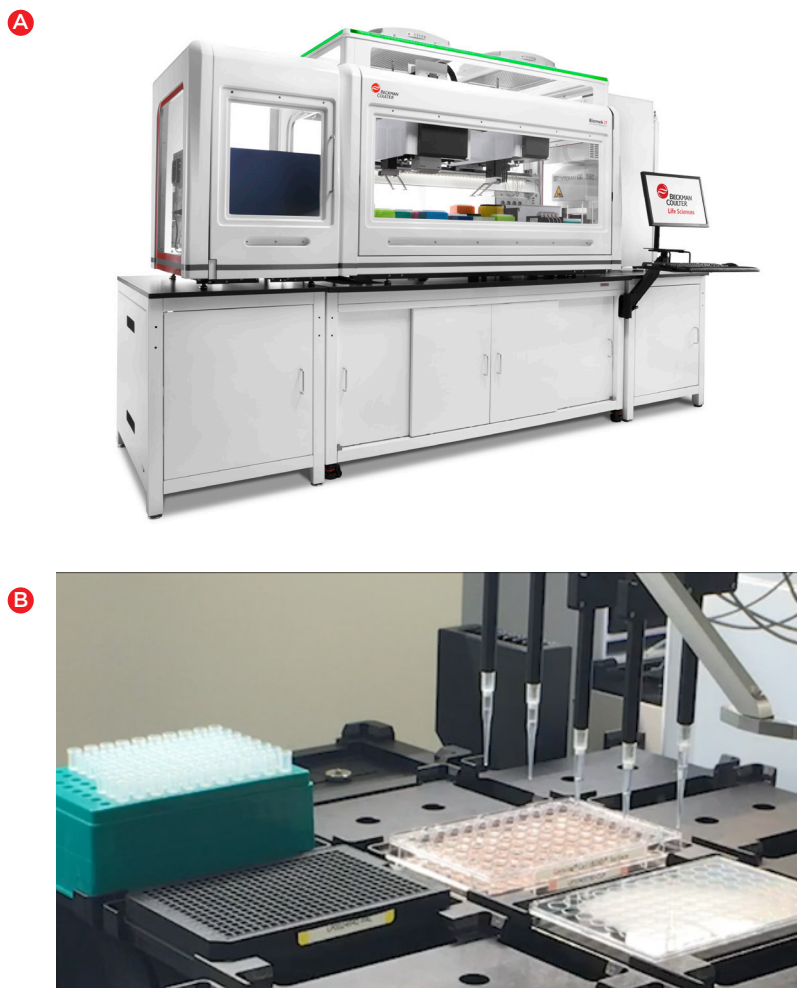
Figure 2. Automated hit picking. A) Biomek i7 with HEPA filters and integrated devices utilized for cell line development. B) Media from the ~15% of wells with colony growth from a single cell were sampled using the Span-8 pipettors and transferred to a black 384-well Tilted Well Plate for analysis on the Octet HTX (Pall Forte Bio).

We utilized the Span-8 pod of a Biomek i7 (Figure 2A) to rapidly sample the media from the primary hit wells across four 96-well plates. The transfers were directly driven by the imported confluence data and the spanning capability enabled the simultaneous sampling of multiple spaced wells per column to accelerate the process (Figure 2B). In addition, the fine level of pipetting control allowed slow aspirate speeds and optimal tip location to avoid disrupting the loosely adherent cells. The Span-8 pod dispensed replicate wells for each primary hit well into a single black 384-well plate – a challenging labware to execute a reformatting process with manually. This plate was then analyzed on an Octet HTX (Pall Forte Bio) to determine IgG titers.