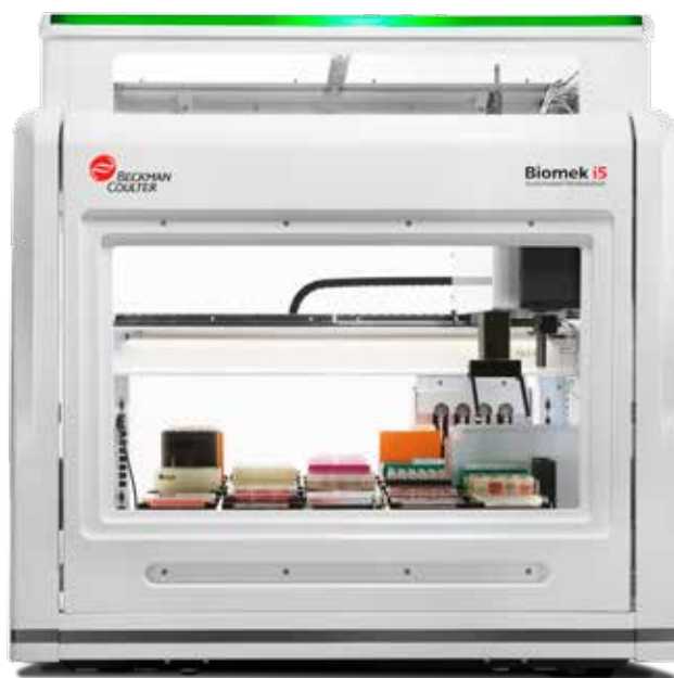
Figure 1. Biomek i5 Span-8 Instrument

The value of automating a complex or lengthy workflow is readily apparent to the scientist that is freed from the bench. However, automation of simple protocols also provides value if the automated method is simple to create and/or the protocol is run with high frequency. As an example, we demonstrate the ease with which a Bradford assay was automated on the Biomek i5 instrument (Figure 1).